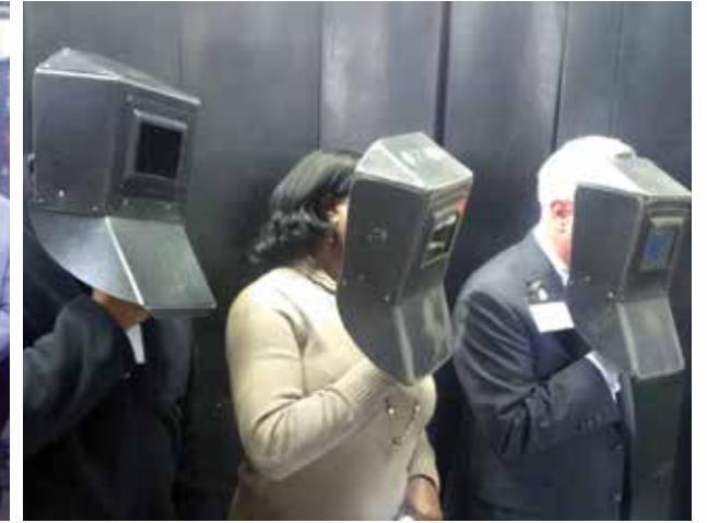
readySC representatives traveled to Düsseldorf, Germany to tour the Mercedes-Benz production facility and assess the company's training needs.

To begin assessing the extent of the company's training and recruitment needs, a readySC Discovery team traveled to Daimler's Mercedes-Benz plant in Düsseldorf, Germany in December 2015. Comprised of SC Technical College System and readySC leaders, curriculum developers, instructors and project managers, the team met with Daimler training and human resources managers to observe and collect data on the plant.