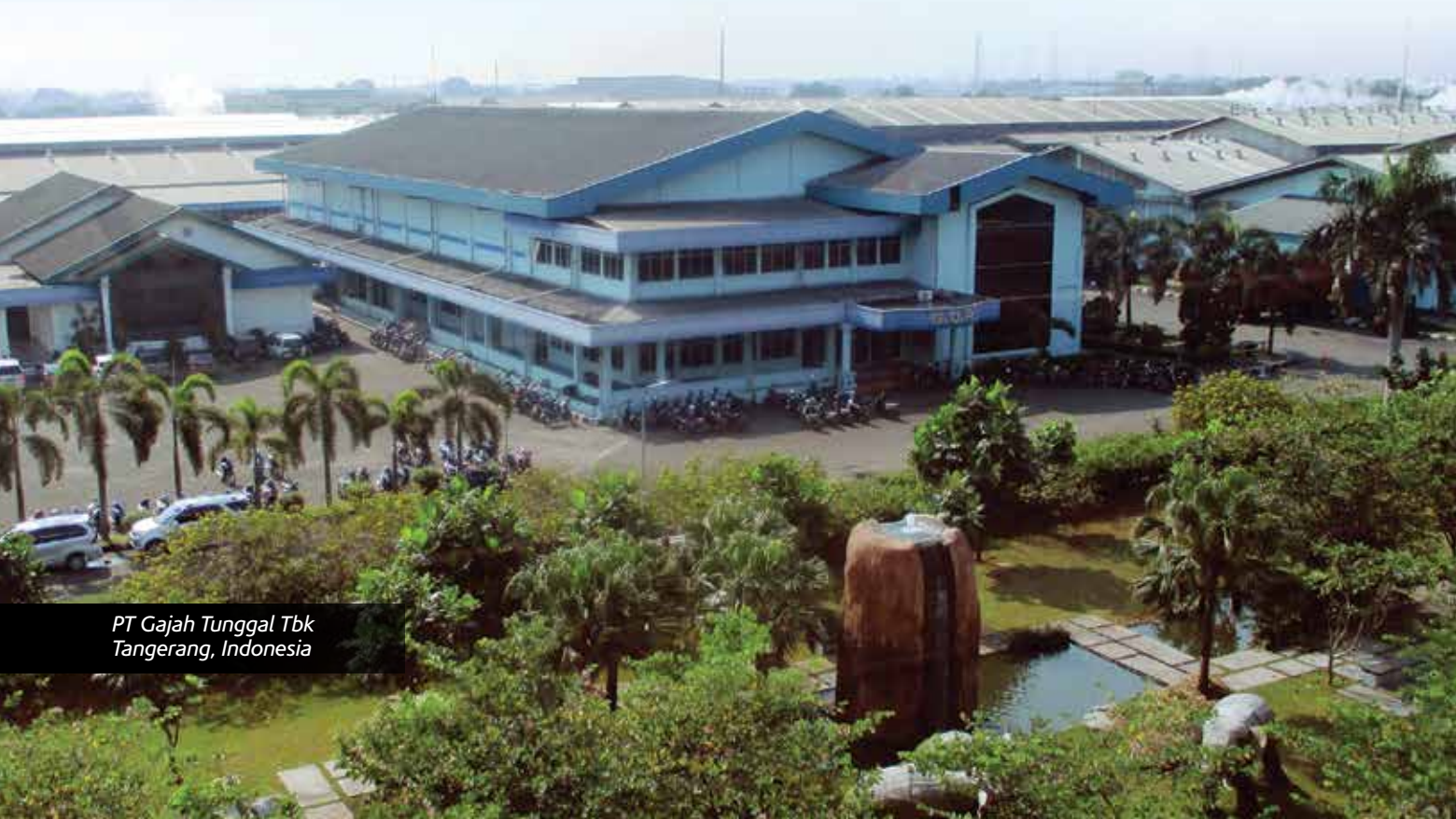
PT Gajah Tunggal Tbk Tangerang, Indonesia

G ITI Tire, the 10 th largest tire company in the world and one of the most successful in Asia, announced in June 2014 that it would establish its first North American manufacturing facility in Richburg, South Carolina. For the Singapore-based company, this will be its first manufacturing facility built outside of the continent of Asia.