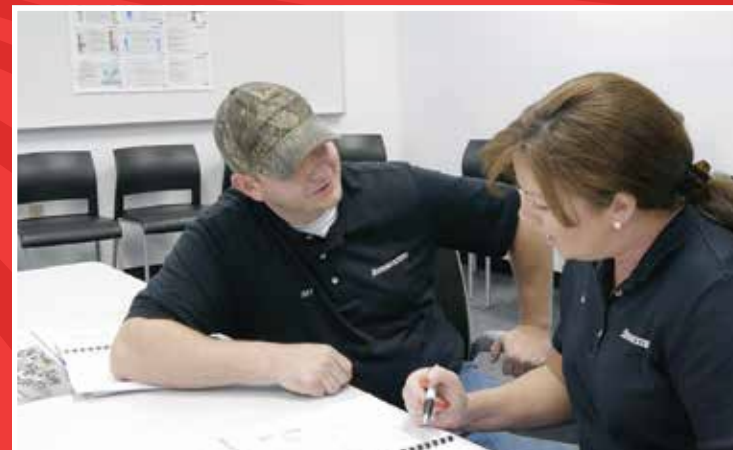
The train-the-trainer course requires each student to demonstrate what they've learned by teaching a skill to someone else.